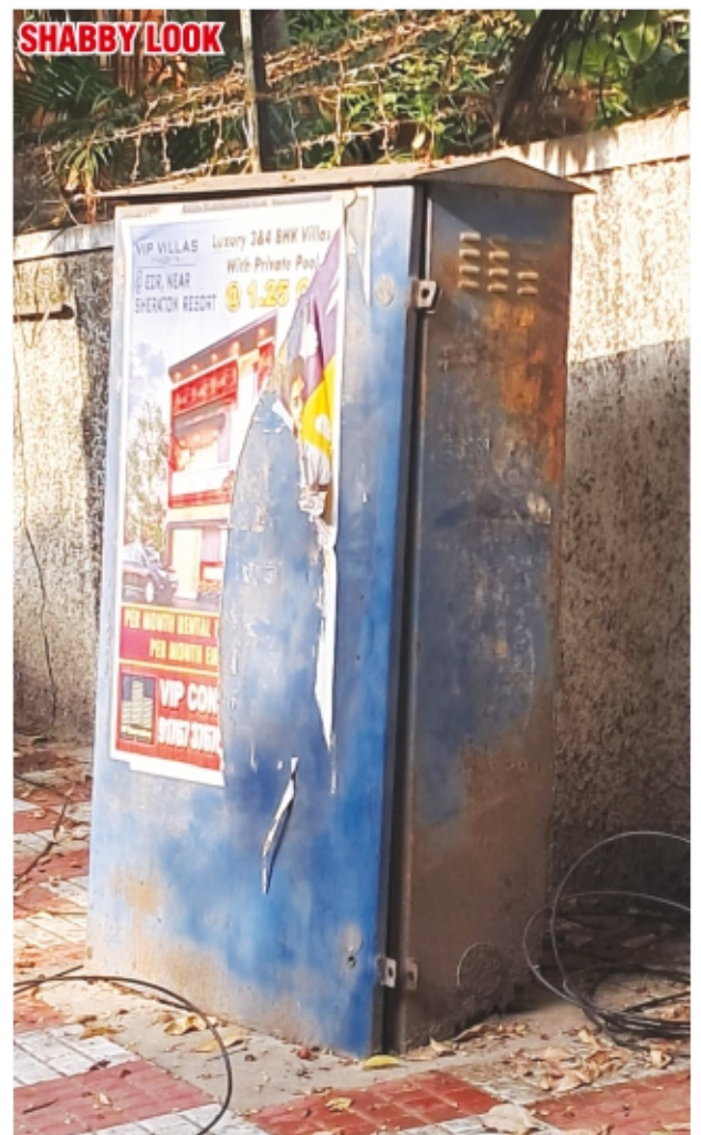
Unused telephone box in Arulambal Street, T Nagar should be replaced with new one are if not in use it should be removed. Will the concern authorities do it.

TIMING : 10.00 am to 8.00 pm SUNDAY FULL DAY OPEN HOME VISITS UNDERTAKEN