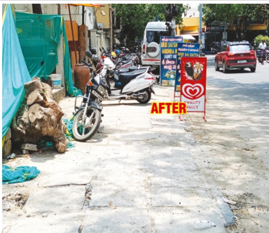
Old transformer removed after publishing in Kodambakkam Times recently at Valliamal Garden, Rangarajapuram.