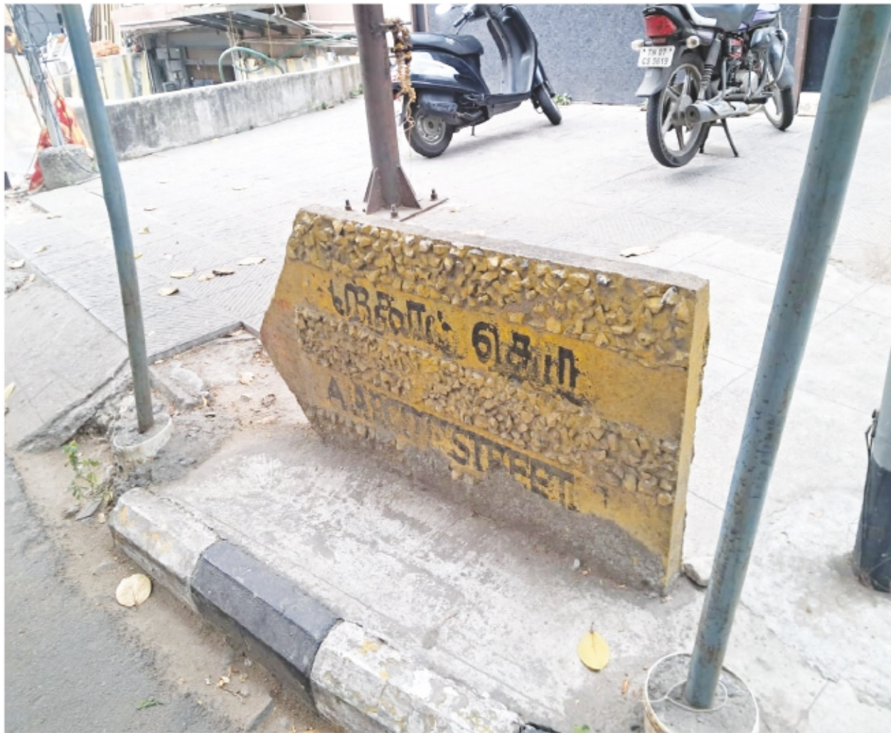
NEED REPLACEMENT : Sign Board seen in the picture is Arcot Street, T Nagar. When roads become higher and higher old Cement sign boards getting shorter its time to change where ever it is necessary.