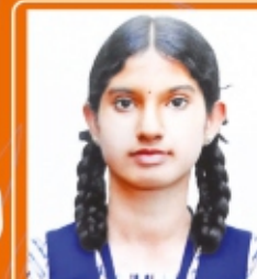
VARAANGANA C L 93.2%