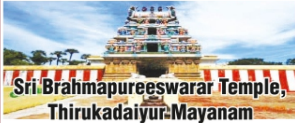
Sri Brahmapureswarar Temple, Thirukadaiyur-Mayanam

This is the 165th Thevara Paadal Petra Shiva Sthalam and the 48th Sthalam on the south side of river Kaveri in Chozha Nadu. This place was called Kadavur Mayanam during the 6th to 7th Century and is now called Thirukadaiyur Meignanam (Thirumayanam/Thirumeignanam).