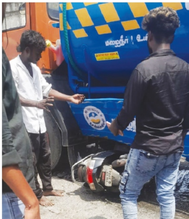
A SUDDEN COMMOTION : A young man skidded his two wheeler in Double Tank Road and escaped with miled injuries. Two wheeler struck inside the metro water tank lorry. It was retrieved later by the public.