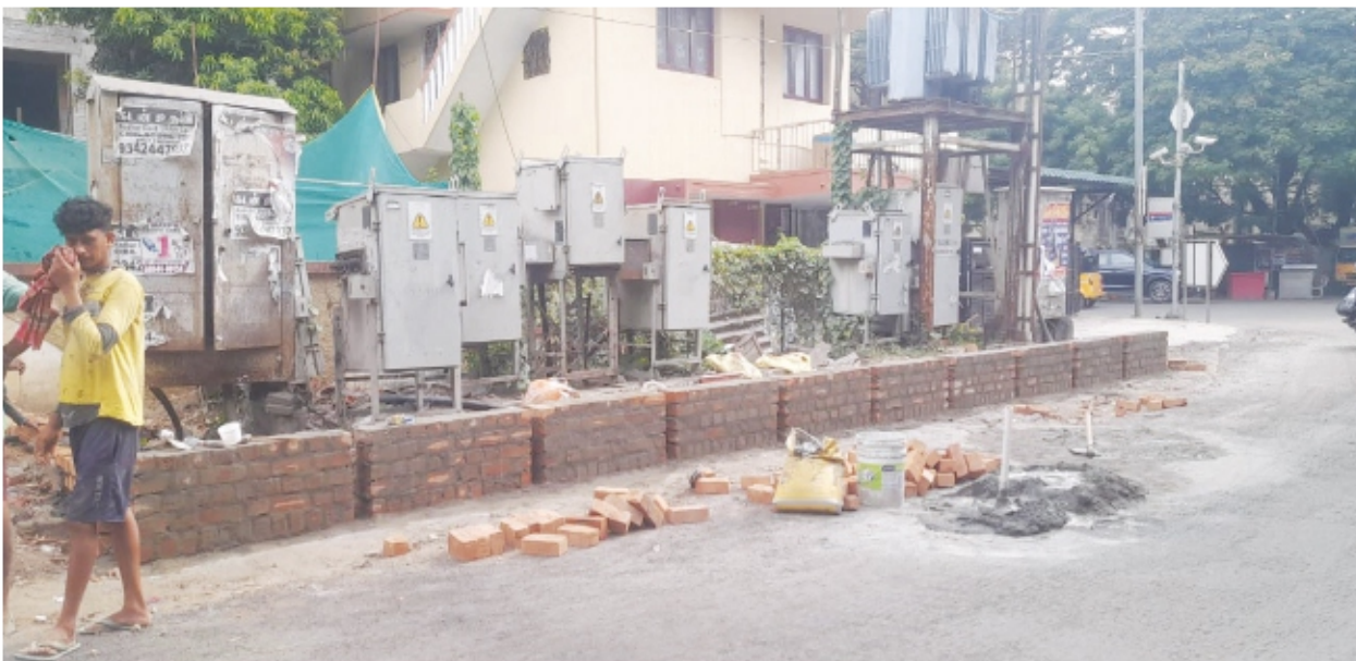
A full cover : GCC is constructing compound wall to cover all the EB junction box at Balakrishna Street, West Mambalam. Before it was full of bushes and creeps around. After constructing it will give a pleasant look says a resident.

All programs will be web cast live on both days 19th & 20th July, 2025. Visit Om Charitable Trust in YouTube channel for the telecast.