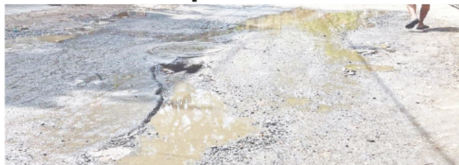
The manhole cover at the location has been damaged for close to a week, and residents claim that despite complaints, no action has been taken so far.