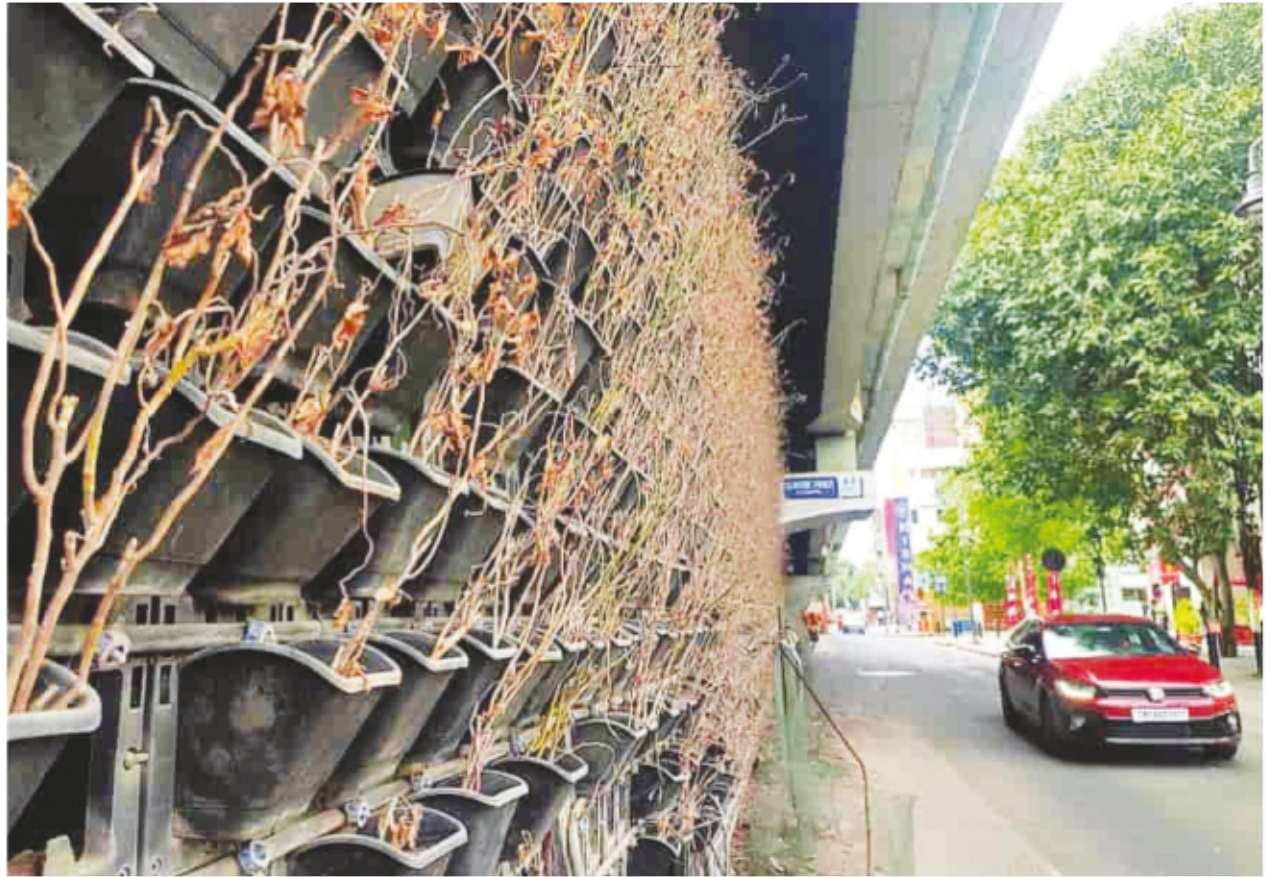
HIGH AND DRY : Summer months have caused the vertical garden beneath Usman Road flyover in tech commercial hub of T Nagar to wither.