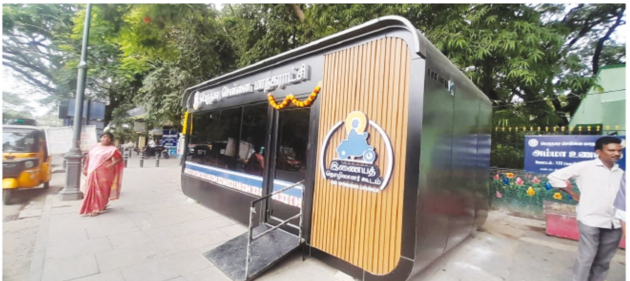
Greater Chennai Corporation (GCC) has installed ramps at entrances of gig workers' lounges in T Nagar. These lounges for delivery partners are air conditioned and have toilets as well as power outlets to recharge mobile phones between orders. With the addition of the ramps, these resting facilities are now accessible to persons with disabilities.

PREDICTION FOR THIS WEEK 27.07.2025 TO 02.08.2025