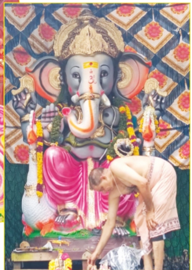
Thambiah Road, West Mambalam