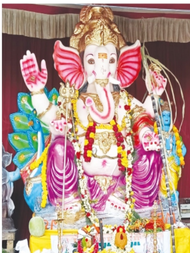
P V Rajamannar Salai, K K Nagar