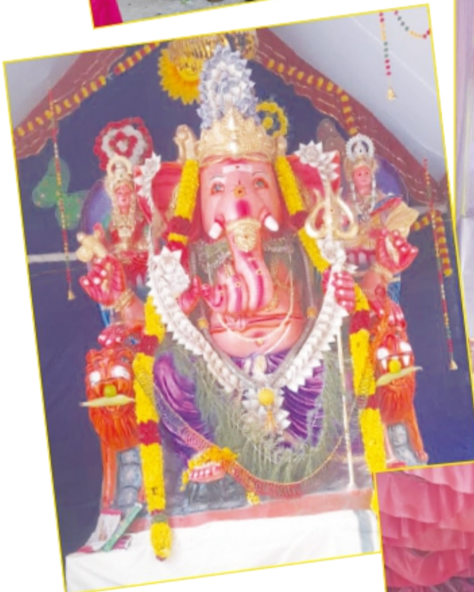
Pushpavathiammal Street, West Mambalam