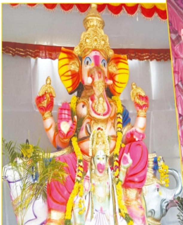
Rangrajapuram Main Road, West Mambalam