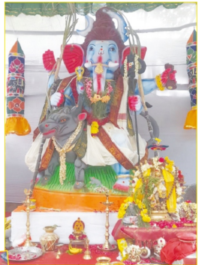
Govindhan Road, West Mambalam