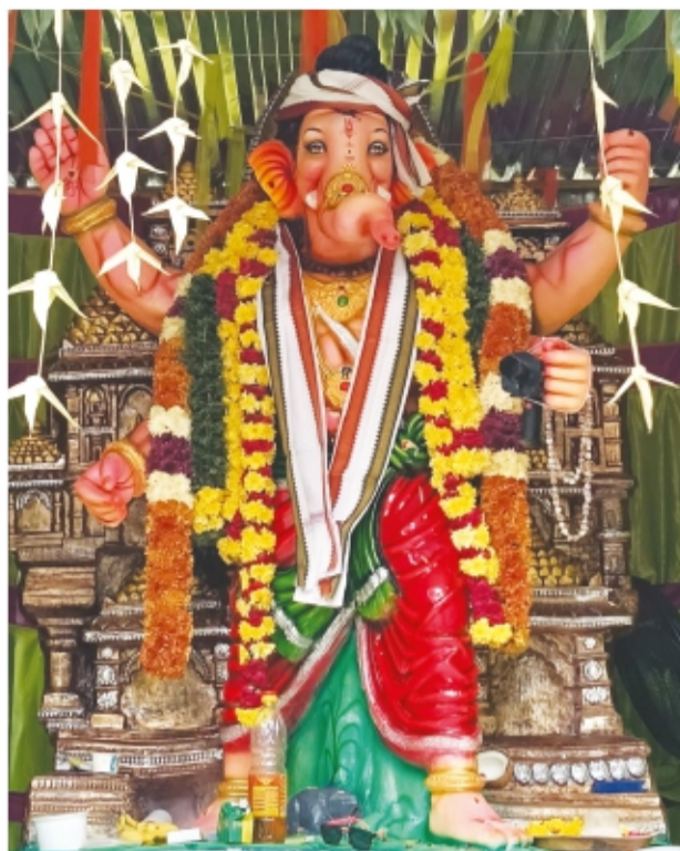
Bazaar Road K K Nagar