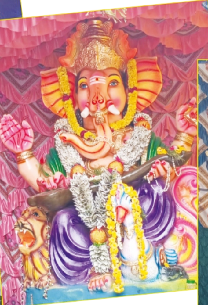
Station Road, West Mambalam