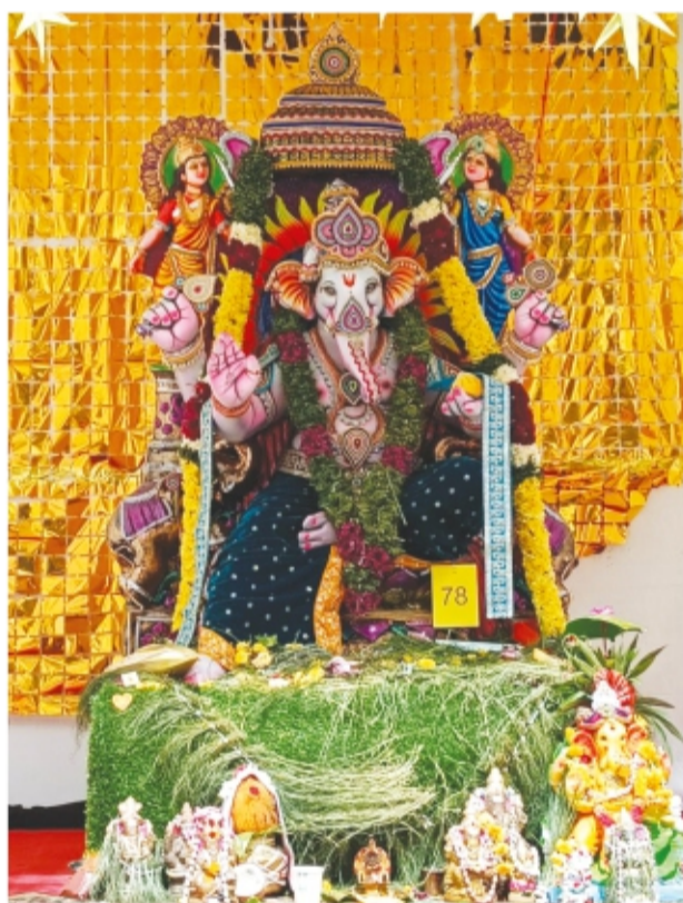
Kanun Nagar Main Road, K K Nagar