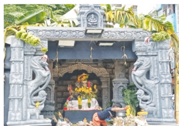
Ramaswamy Road, K K Nagar