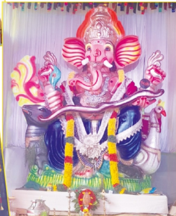
Gandhi Street, West Mambalam