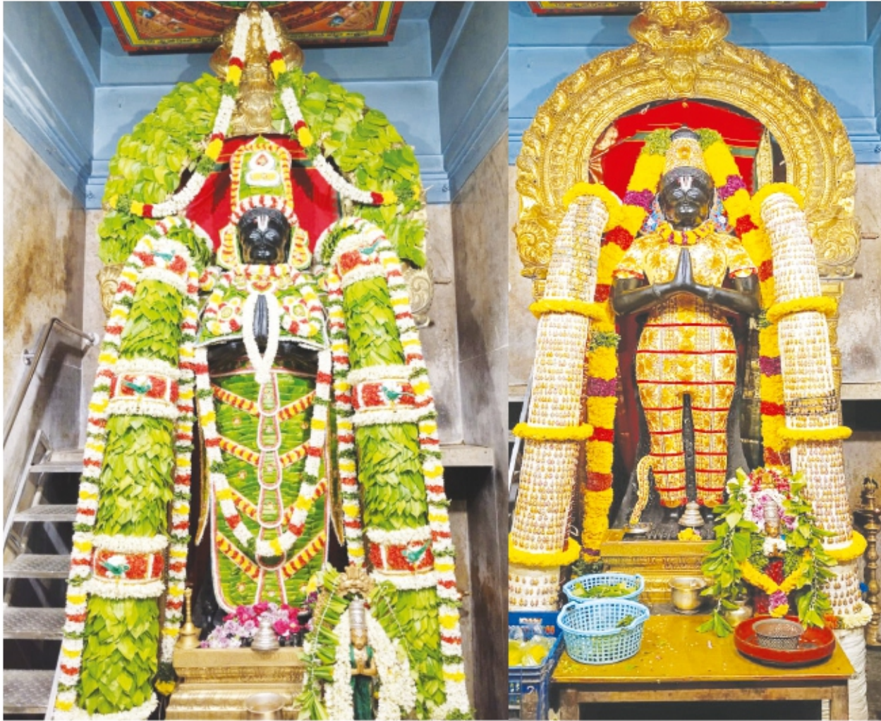
First day of Sri Hanuman Jayanti Vethalai Malai Malai Decoration, Second day Special Sakala Drishti Relief Dollar Decoration.