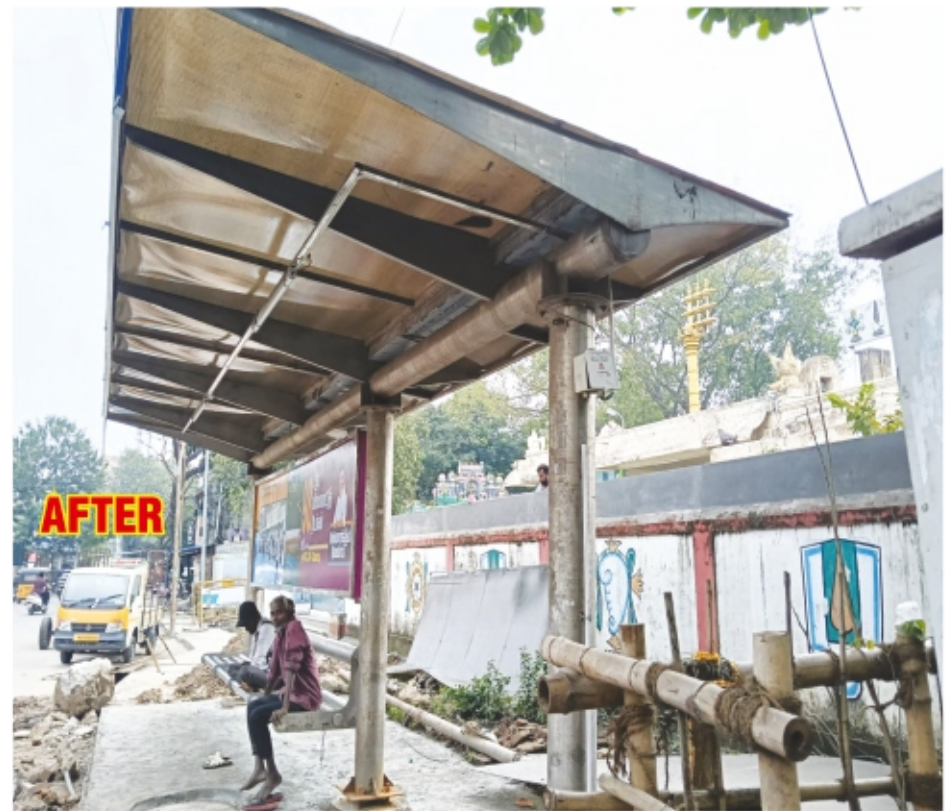
Kodambakkam Times reported last week regarding this modern bus stop at Govindan Road, West Mambalam. Officials have rectified and erected the modern bus stop.