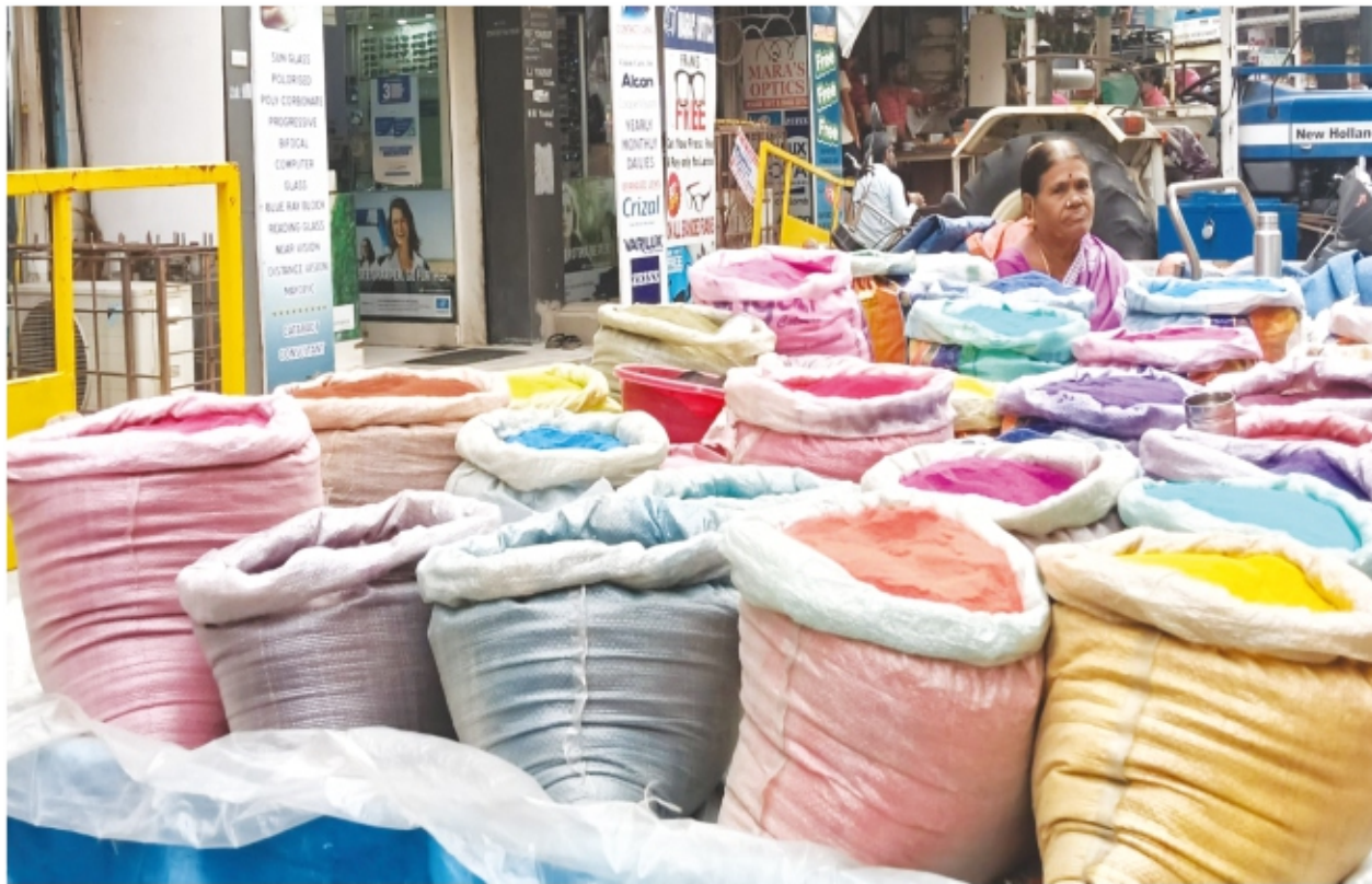
As new year and pongal approaching vendors are seen selling colour kola powder in Station Road, Mambalam. She is also selling rangoli stencils and other accessories. The colours are available in different shades, and are priced at Rs. 20 for 250 gm.