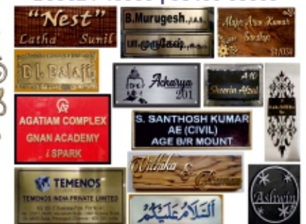
ALL MODEL NAME PLATES

#57A, (8A) Sapthaswara Apts, 1st Avenue, 100 ft Road, Ashok Nagar, Chennai - 83. | Email : masterstroke94@gmail.com | www.masterstrokes.co.in