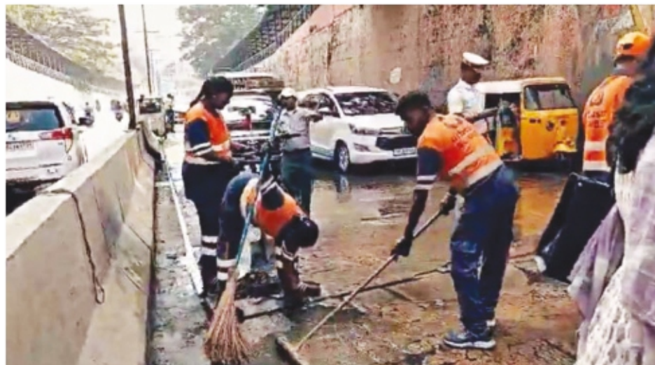
Recently dewatering works carried out by Greater Chennai Corporation