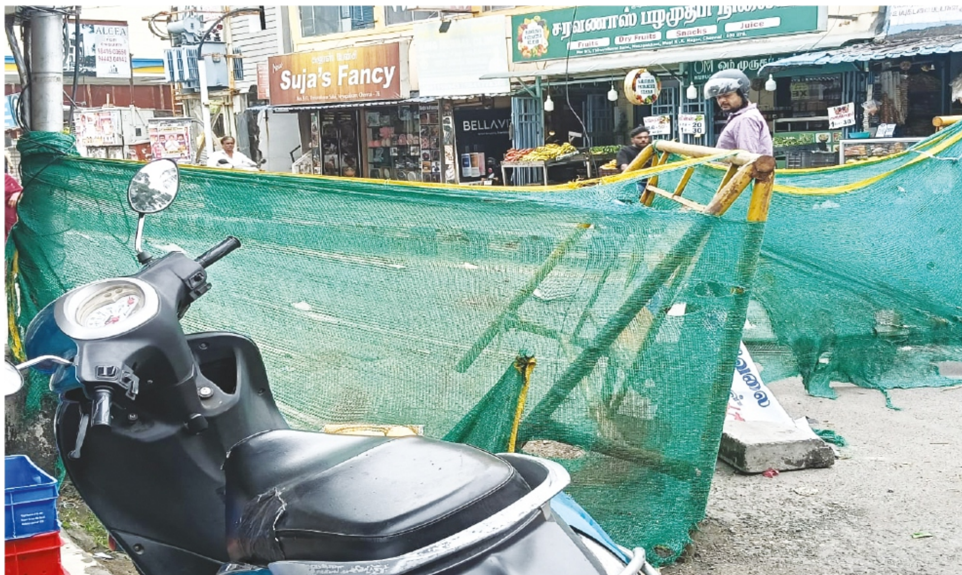
TAKE DIVERSION : Road closed for metro work on Tiruvalluvar Road, Nesapakkam Junction. This junction is mainly connected to Ramapuram, Ashok Nagar and Virugambakkam.