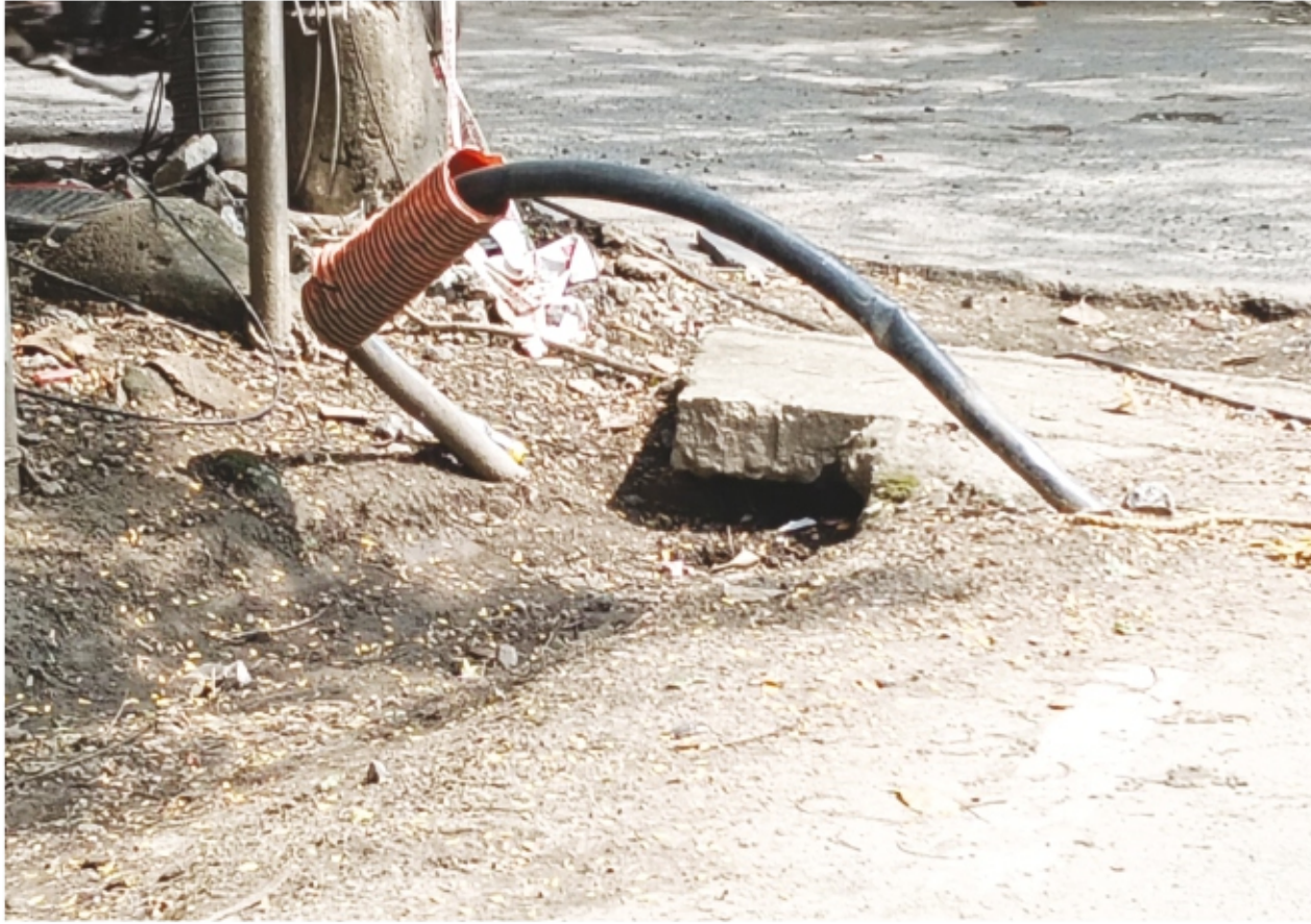
Under ground cables are not placed properly at Kumaran Colony, 2nd Street, Vadapalani. The cable wire which disturbs the pedestrians and motorists. It is more invisible at night. Will the concern authorities bury it properly.