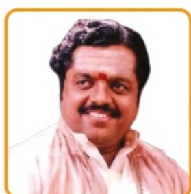
Dr. SIRKAZHI G SIVACHIDAMBARAM

Carnatic Music Vocalist & Playback Singer