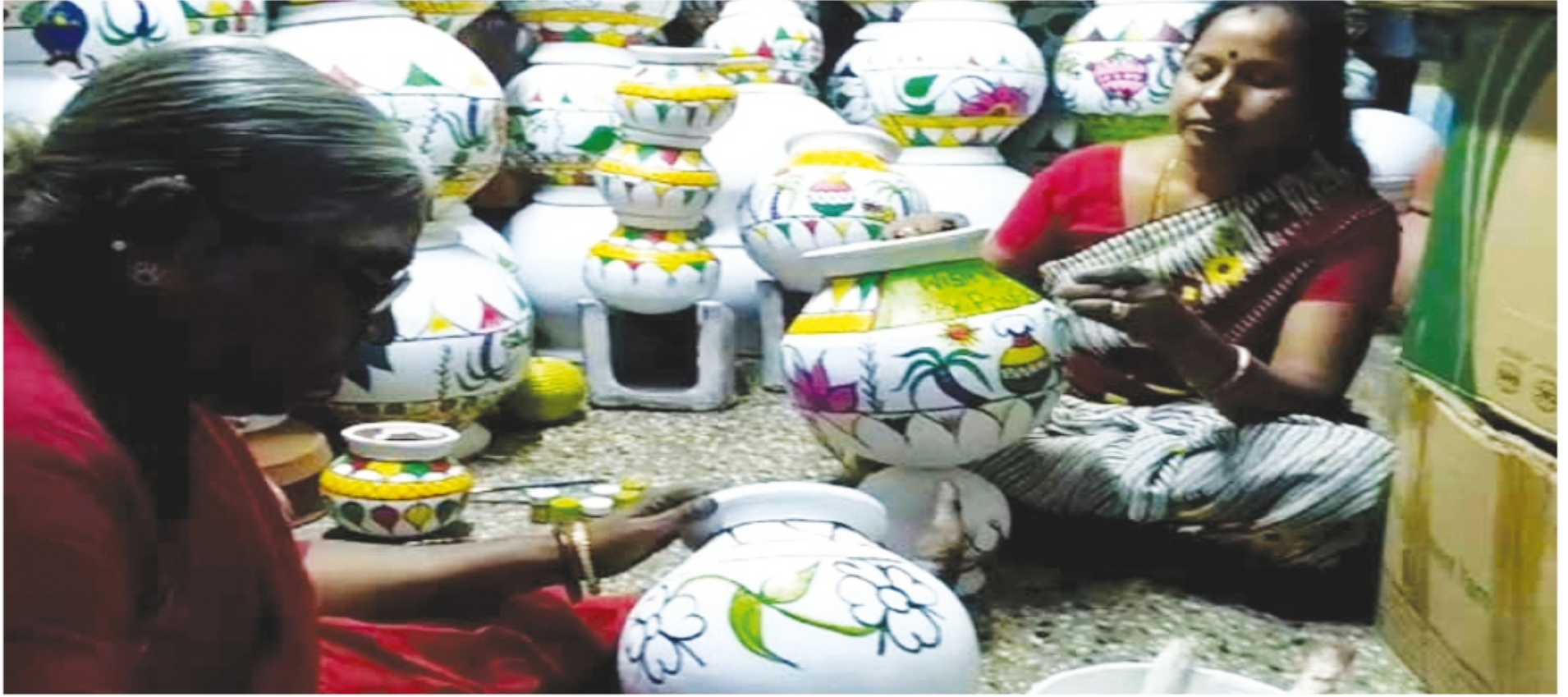
Workers painting clay pots on the occasion of the Pongal festival. Clay pots are available in different colors and are soled at Kodambakkam High Road.