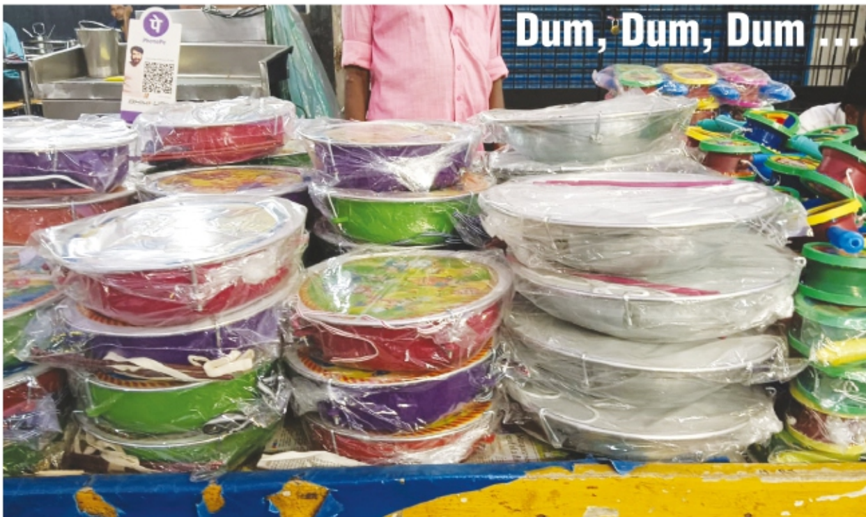
PONGAL ARRIVALS : A road side shopkeeper selling all sizes of drums for this Pongal at T Nagar, Ranganathan Street the rate starts from 20, 100 & 350 etc.

Seven trucks of sugarcane arrived Tuesday. A bundle of 18 pieces is being sold for Rs. 400-600.